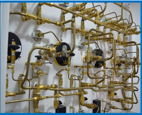
THREE DIVER MIXED GAS CONTROL PANEL - BACK