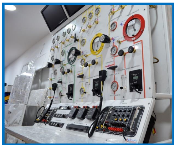
THREE DIVER MIXED GAS CONTROL PANEL - FRONT