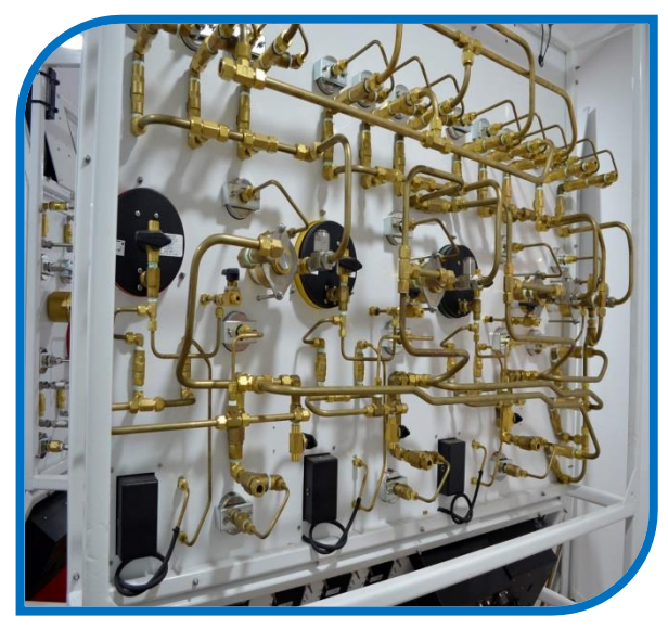
Mixed Gas Control Panel Back - Tubing System

An IMCA D037 compliant Three Diver Surface Mounted Control Mixed Gas Panel is designed to individually control and monitor the primary and secondary air supply of each diver. It has an individual gauges and regulator assigned for each diver.